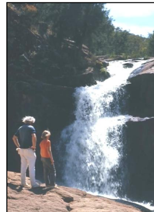
Lower Ginninderra Falls

In 2011 a North Canberra community group developed a proposal to create a national park just north of the ACT border around the confluence of Ginninderra Creek and the Murrumbidgee River. This document outlines the status of that proposal and outline progress towards the twin goals -